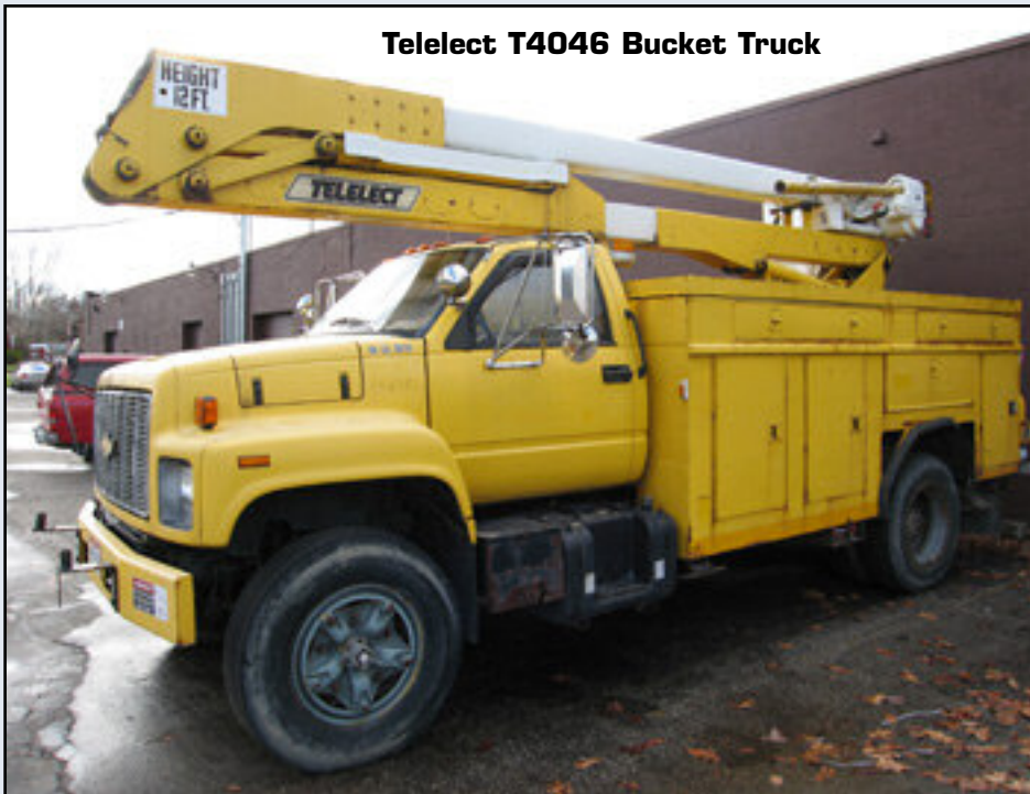
Telelect T4046 Bucket Truck