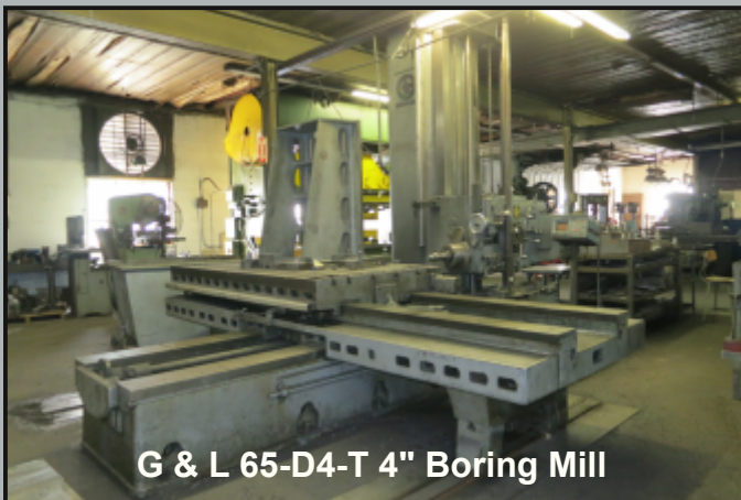
G & L 65-D4-T 4" Boring Mill