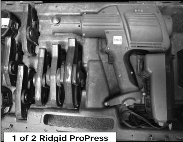
1 of 2 Ridgid ProPress

Partial listing: Victaulic fittings & clamps to 10" • large quantity assorted pipe hangers • lg. quantity no-hub clamps plus FM approved clamps • assorted valves, all sizes, bronze • ss weld fittings • screwed fittings • Schedule 80 PVC fittings, valves, etc. • PVC drainage fittings • copper fittings • large quantity assorted hardware