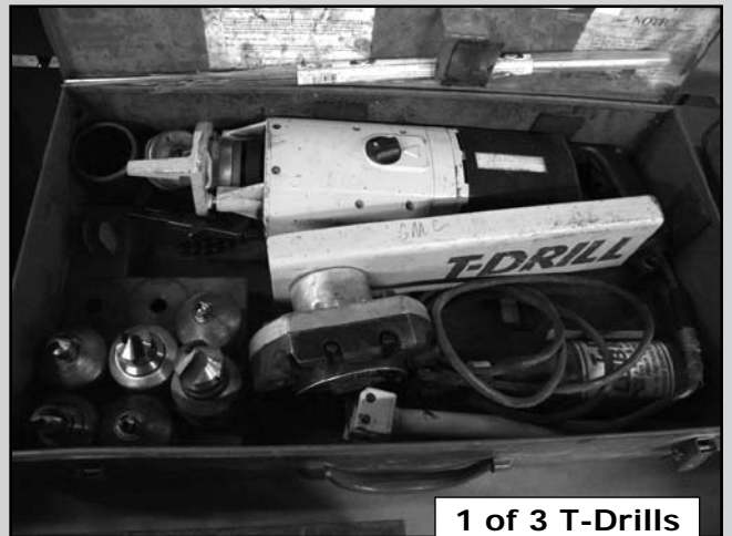
1 of 3 T-Drills